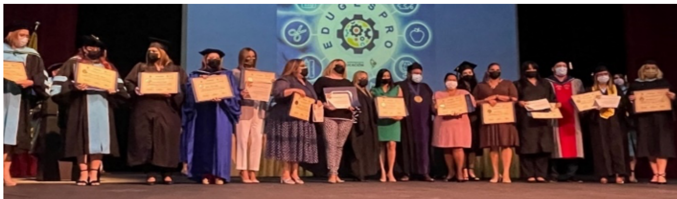
Regional team receiving EDUGESPRO certificate on graduation day, May 2022.

Working together, IDPRU and R3CC created the Professional Development Academy for Management, Leadership and Professionalism (EDUGESPRO). Since then, EDUGESPRO has impacted more than 500 school and regional leaders in Puerto Rico. Indeed, EDUGESPRO has become PRDE's signature leadership academy program.